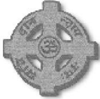
The Cosmic Cross at Shantivanam

we open ourselves with the Holy Spirit and we are the authentic church. And finally, people I respect as much as any, the Society of Friends, the Quakers, they say that the Holy Spirit is present in the heart, and if you sit around quietly, meditate in silence, the Holy Spirit will give you all that you need. You don't need priests or sacraments or doctrines, just sit and wait on the Holy Spirit. That's another way.